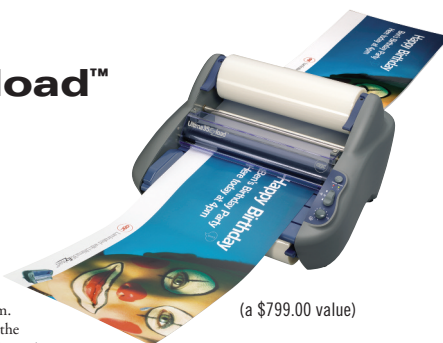
(a $799.00 value)

when you purchase a Pinnacle 27 EZload™ Laminator.